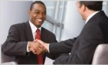
Career & Technical Opportunities

Marine for Life Network can guide your search for: