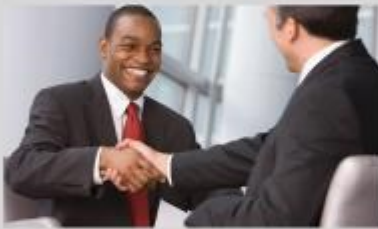
Career & Technical Opportunities

Marine for Life Network can guide your search for: