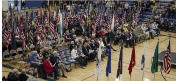
Massing of Colors Ceremony

You are Cordially Invited to a Massing of Colors Ceremony on February 17, 2024 10 AM at Ridgeview High School Cafetorium 466 Madison Avenue, Orange Park, FL 32065