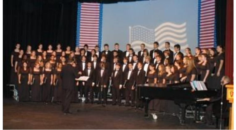
The St. Johns Chamber Singers