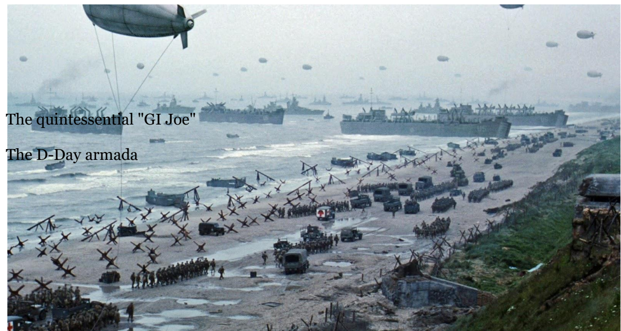
The quintessential "GI Joe"