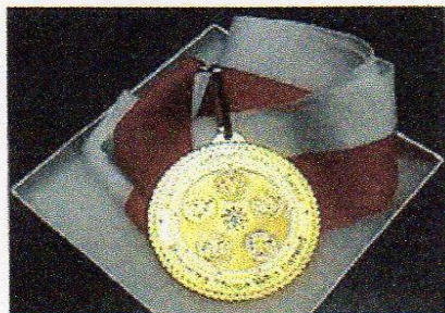
To honor the Sunshine State's more than 1.5 million honorably discharged veterans.

(727) 518-3202, Ext. 5572 or (850) 487-1533