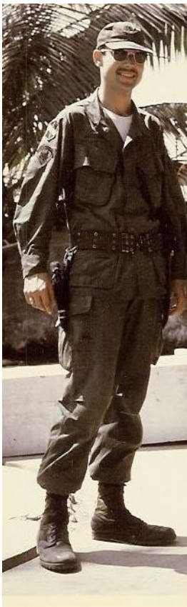
1967 Danang Vietnam