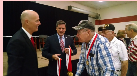
Receiving the Governor's Service Awards at the National Guard Armory 6/25/2015.