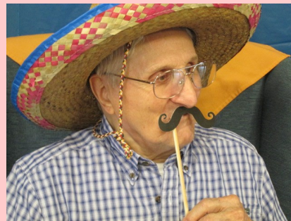
Father's Day Photo booth