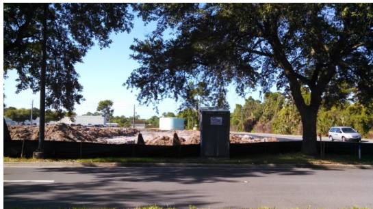
CBOC Phase 4