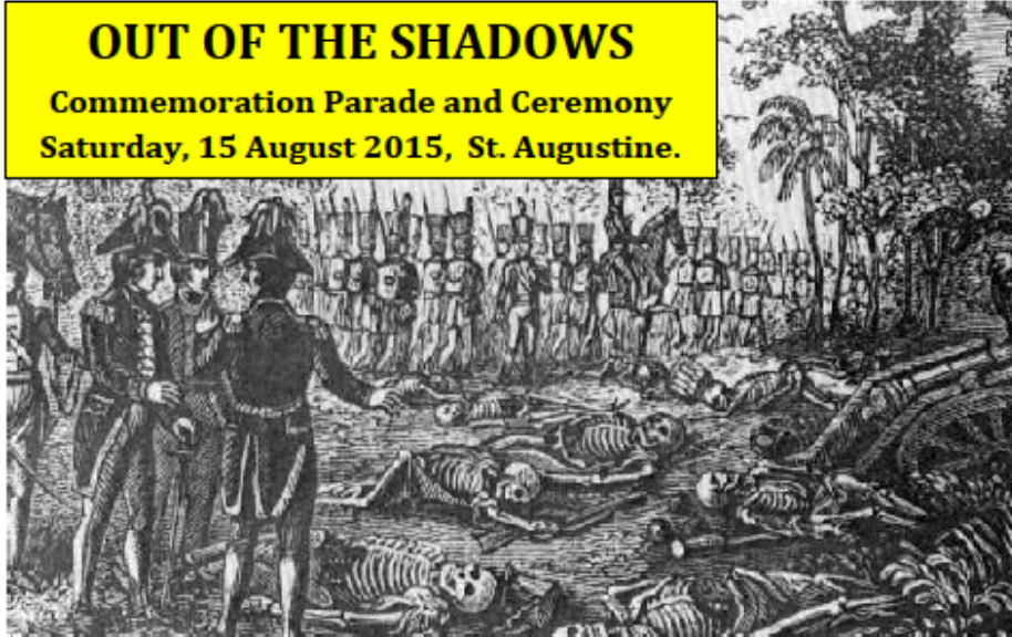
Brigadier Gaines and officers survey the largely unmolested remains of Major Francis L. Dade's column, two months after its annihilation by Seminole Indians on 28 December, 1835.

Commemoration Parade and Ceremony Saturday, 15 August 2015, St. Augustine.